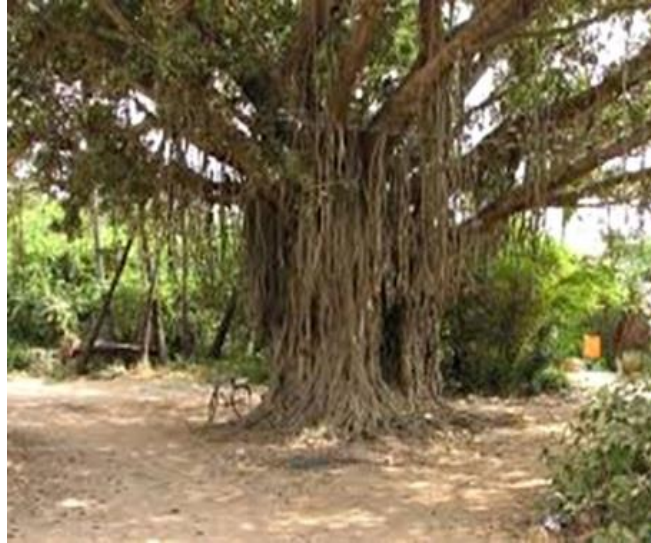
Plate : Ficus religiosa Tree with Jata

The scientists mentioned it's following Phyto-chemical applied aspects - as a tonic, in the cure of leucorrhoea, it prevent bleeding, in rheumatism pain, thus used as a indigenous medicine by the vedhs in ayurvedic traditional medicine. It's wood is used in sacrificial fires.