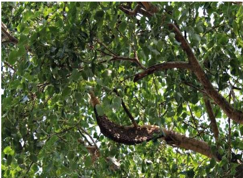
Plate : Ficus religiosa Tree

It is a full sized tree, thus, it falls under the group of 'tree' from vegetational group point of view. It is a religious plant of Moraceae family for Hindus from centuries back, hence, it's species is known as Ficus religiosa . From leaf-class classification point of view-the tree falls to the class of 'macrophylls'. From xerophytic categorization point of view, the upper surface of leaves are coated with waxy substances. From life-forms classification point of view - the tree falls in the group of 'phanerophytes'. Being, it's importance from religious point of view, it is protected from cutting and it is being worshipped throughout the Indian sub-continent wherever Hindu population is dominant (Plate).