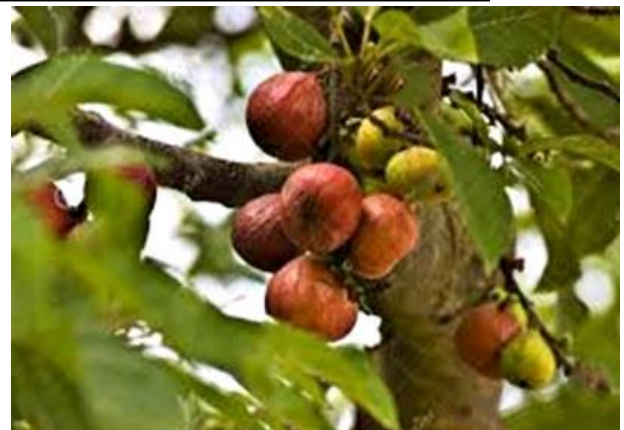
Plate : Ficus religiosa Fruits

It contains essential volatile oil, some Glycosides Enzymes and some minerals.