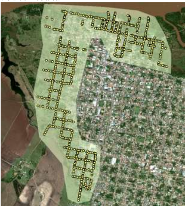
Fig. 2: Points collected on the study area

The MDE generation points were obtained by means of GNSS positioning using 5 Frequency GNSS receivers (L1 / L2) of the brand ASTEK, model Promark 500, by the static method. The techniques and methodologies for the geodetic survey presented in this paper follow the recommendations for GPS surveys of IBGE. At the end of the field campaigns, a total of 836 points were distributed throughout the study region. It should be noted that the survey was conducted only in the urbanized area.