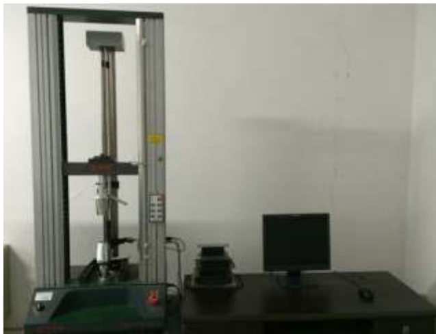
Fig. 1 Material testing machine controlled by computer

Test device is universal testing machine controlled by the microcomputer (sans Material Inspection Co., CMT6104, CHINA), as shown in figure 1. The displacement control is adopted in the experiment, and the loading speed is 0.5mm/min. The test load starts from 0 and gradually applies linear load until the component is destroyed.