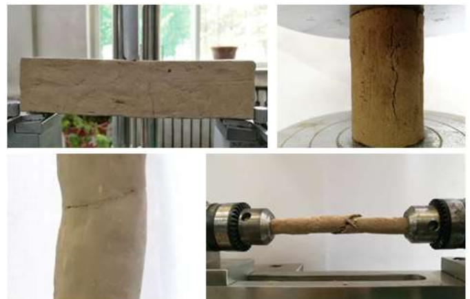
Fig.4 Surface cracks of specimens (including bending, compressive, bending and tensile and torsional strength tests) Excel software is used to calculate the mean value of repeated samples with limit values. The results are summarized as table 3:

When the specimen is sheared, the crack process is not easy to be observed. It is easily concluded from the stress-strain curve that When the load is small, the stress-strain curve is approximately straight. With the increase of load, when the content of Caragana is low, the properties of brittle materials are obvious; when the content of Caragana increased, the properties of plastic materials is showed gradually, and with the increase of the content and length of Caragana, this phenomenon became more obvious.