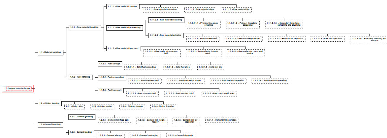
Fig. 2. Pollution Sources Diagram applied to cement manufacturing.

It was decomposed into two processes: cement grinding (1.3.1) and cement loading (1.3.2). It was not necessary to proceed with the decomposition of the processes, as it has already been possible to identify some sources of pollution at this level. In this stage, natural gypsum or anhydrite (up to 5%) and other mineral compounds are added to the clinker during grinding to meet product characteristics. The resulting cement is conducted in a closed-circuit system to the storage silos, from where it is shipped in bulk, or directed to the packing machines and subsequent shipment.