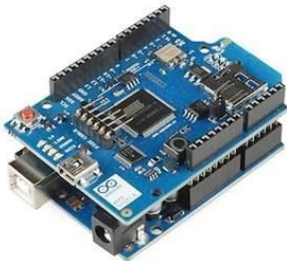
Fig.1. Arduino board with Wi-Fi shield CC3000

This wearable device will be constantly connected to the infant's body.