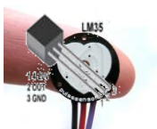
Fig. 4. Pulse sensor A