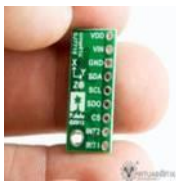
Fig. 3. Accelerometer (LSM303D)