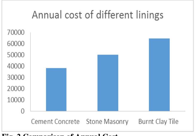
Fig. 2 Comparison of Annual Cost

discussed fairly and a compression with deference to durability and economically.