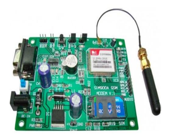
Fig 2. GSM Module

This GSM module is built with the advanced SIM900 engine, works on frequencies EGSM 900 MHz, DCS 1800 MHz and PCS 1900 MHz. It is very compact in size and easy to use as plug in module. The Modem is coming with RS232 interface, which allows you to connect directly to PC or microcontroller /Arduino.