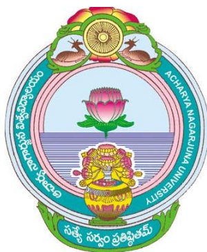
Figure 1: Input Image

The input image is the low resolution image having a resolution of [128*128] which is processed using the proposed algorithm and the output is the high resolution image with resolution [256*256].