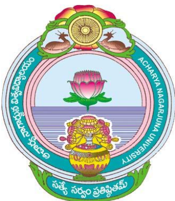
Figure 2 : Output Image (High Resolution Image)